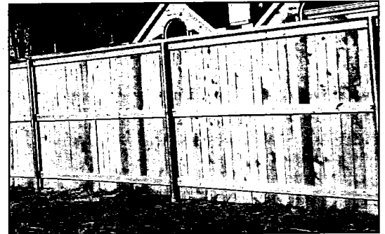
More secure construction